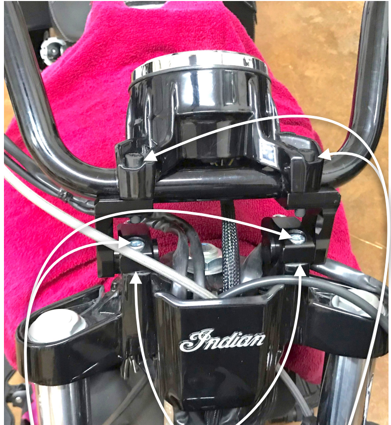
SILVER 30mm bolts

STEP #4: Adjust the risers and handlebar to your preferred position, tighten all bolts down to 18-20 foot lbs.