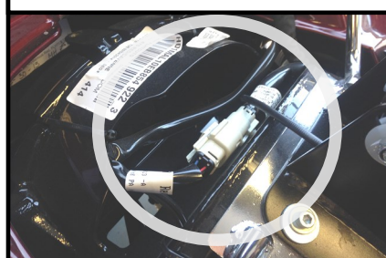
Correct Harness Connector—To Fender