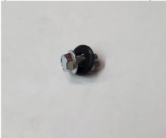
Fig. 3 (IMS Bolt & Washer Combo For Shrouds)