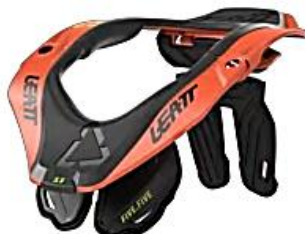
Neck Brace 5.5 Citrus