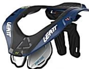
Neck Brace 5.5 Blue