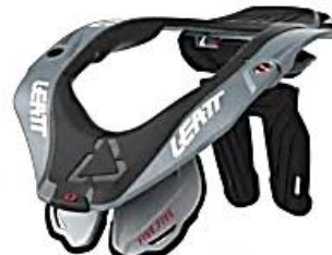
Neck Brace 5.5 Forge