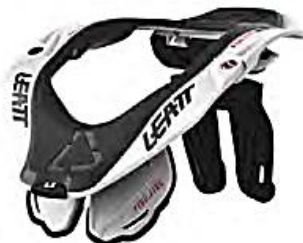
Neck Brace 5.5 Wht