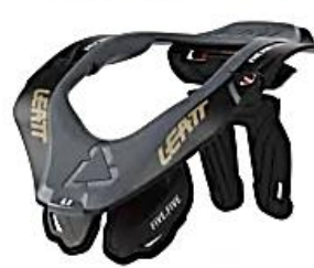
Neck Brace 5.5 #Junior Stealth

NOTE: the Technical File contains a more detailed description of the PPE (material, method of assembly, photographs or drawings), performance data, safety functions and level of protection, elements of conformity to the basic and supplementary requirements. The Technical File is integral part of the present Certification, which has to be kept available by the applicant to be forwarded - upon request - to the entitled person (supervising body, Controlling Officer).