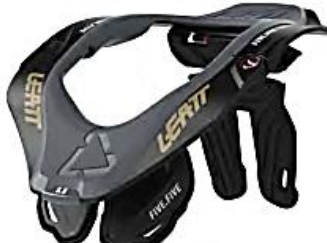
Neck Brace 5.5 Stealth