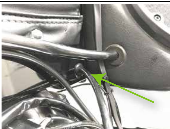
DRILL INTO THE TOUR BOX TO INCREASE THE HOLE SIZE.