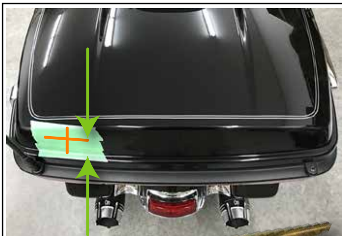
MEASURE 11/16" UP FROM THE RIM OF THE LID AND MARK THE TAPE.