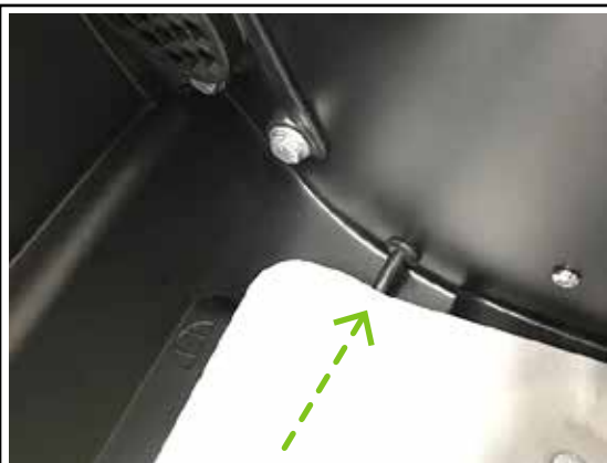
DRILL OUT OF THE TOUR BOX FOR THE PILOT HOLE.