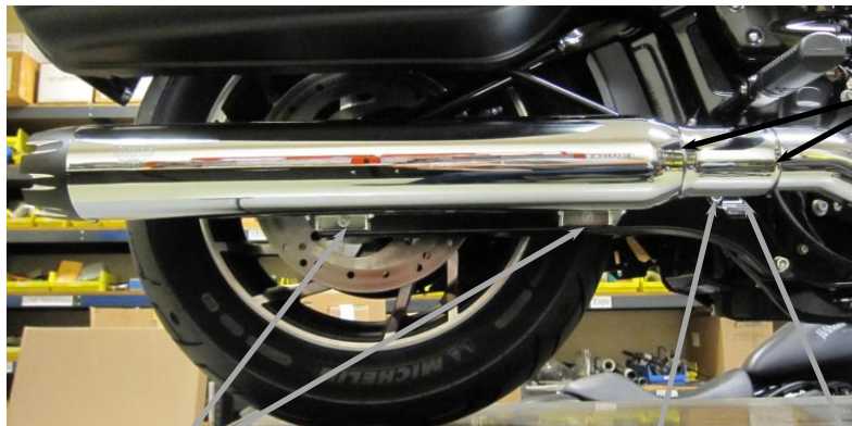
STOCK MOUNTING BOLTS