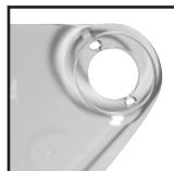
Gen 2 (2 holes)