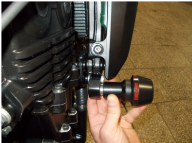
Assembly position (right side)