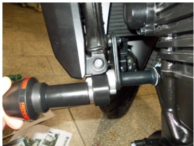
Assembly position (left side)