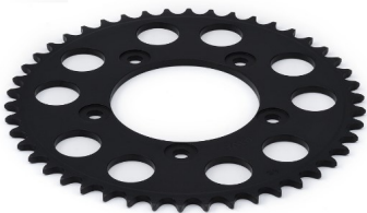
Vintage Rear Sprocket