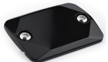
Master Cylinder Cover