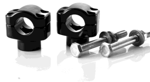
Four Bolt Risers