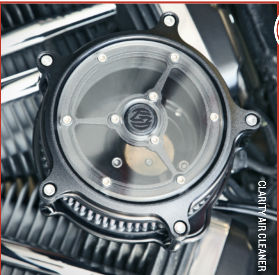
CLARITY AIR CLEANER

For Fuel injected models, you must recalibrate the ECM or buy an aftermarket fuelpack from Vance & Hines to properly calibrate your new intake. Failure to do so may result in engine damage.