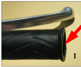
1 Bar Weight Removed

RSA Registered Designs Patents No. A2007/00202 No. A2007/00205 "U.S. Pat. No. US D593,462 S" No. A2007/00203 No. A2007/00206 "U.S. Pat. No. US D593,463 S" No. A2007/00204 No. A2007/00207 "U.S. Pat. No. US D593,464 S"