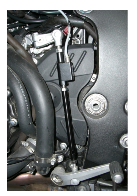
Notes: (1) The female end of Bazzaz shift switches are cross tapped to allow them to be mounted to either the rear set or shift shaft heim joint regardless of the thread design. (2) If the replacement rod supplied with your kit contains female style ends, it is designed to allow the user to shorten its length to suit various aftermarket reset configurations. The female style rods contain grooves in 10mm increments on both ends identifying areas where the rod can be modified and adequate threads will remain for proper installation.