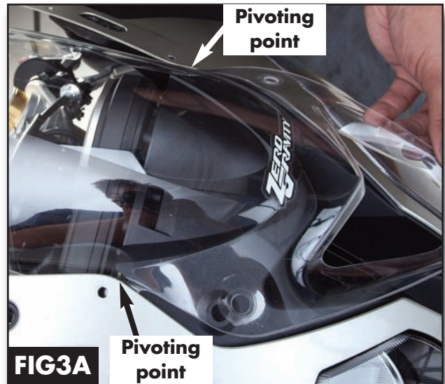
Fig 3A. This photo shows the pivoting points on either side of the screen. Be careful not to over pivot!