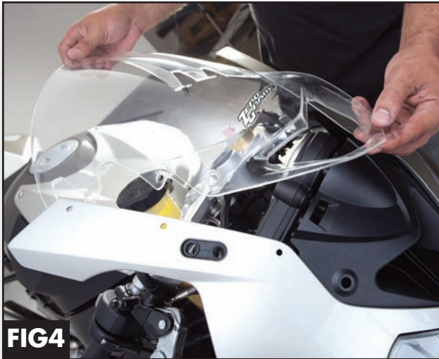
Fig 4. Now you are ready to remove the screen. Slide the windscreen back to remove.