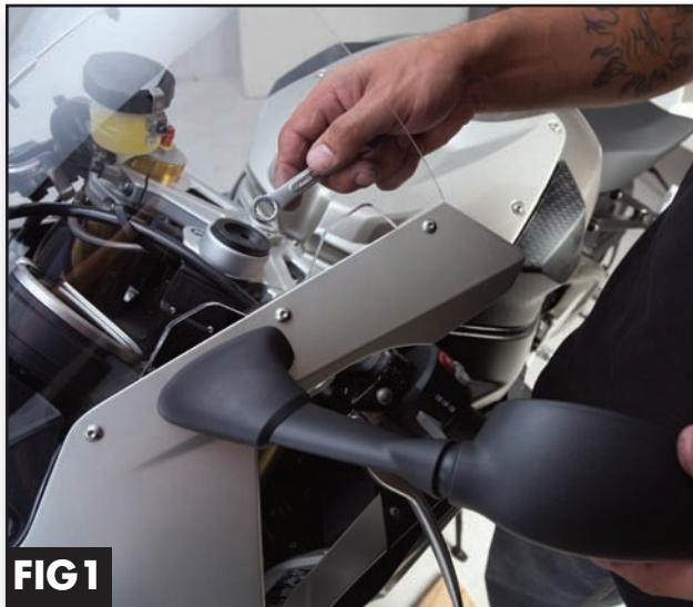
Fig 1. Remove both mirrors. The fasteners are behind the fairing. Be careful not to drop the mirrors!

Helpful hints: Use metric tools, clean hands, put the bike on a stand. Do not pry on the screen excessively, as it can break without much warning.