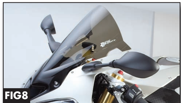
Fig 8. Windscreen and Mirrors installed.

Please see www.zerogravity-racing.com for further information concerning this product.