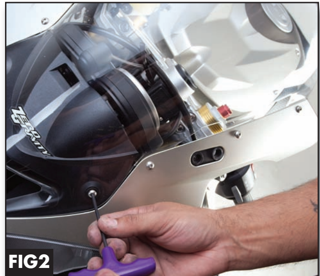
Fig 2. Remove all 8 fastener screws.