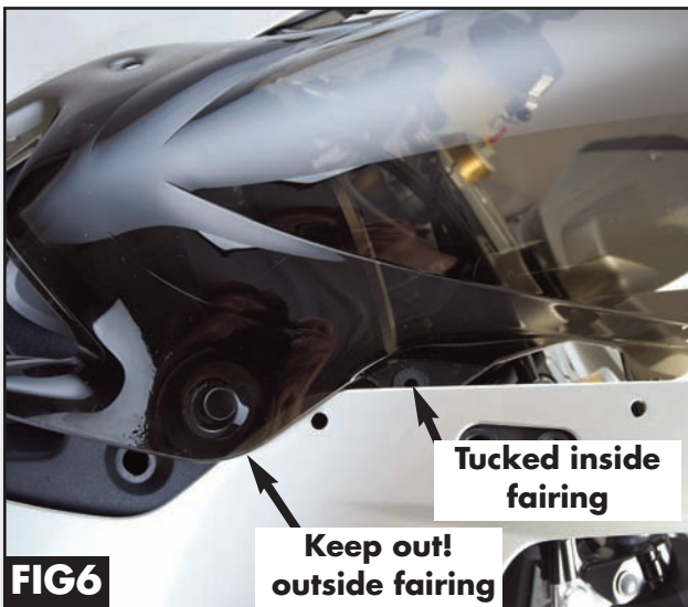
Fig 6. Install screen from the back side. Reclined in position, the front of the windscreen should be on the outer side of the fairing with the wellnut tab tucked inside fairing.