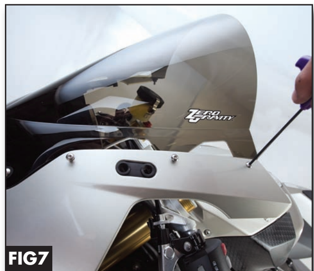
Fig 7. Starting from the top of the windscreen and working down, hand tighten all fasteners then reinstall mirrors.