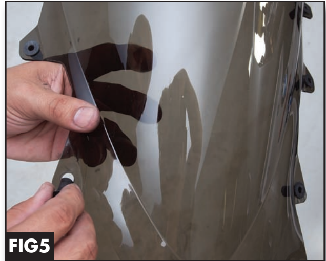
Fig 5. Before installing Zero Gravity Windscreen. Install Rubber wellnuts.